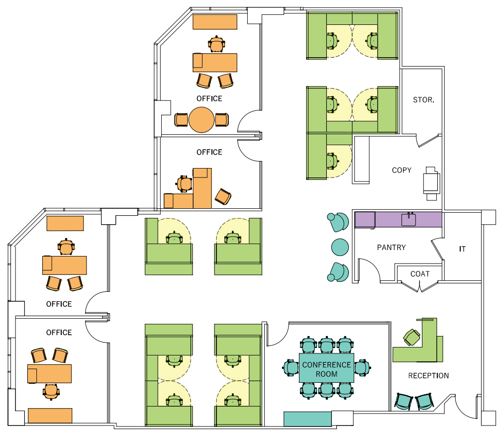
Proposed Tenant Layout