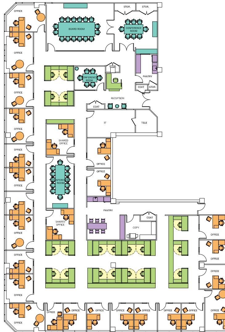
Proposed Tenant Layout